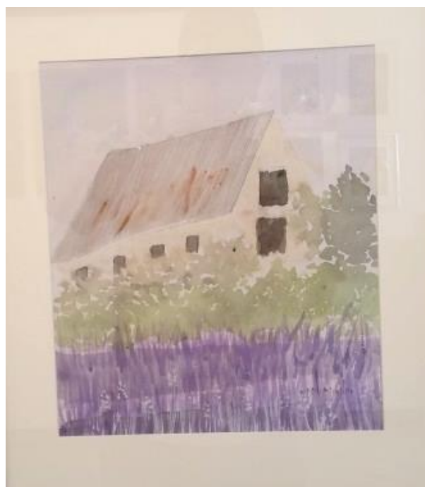
By Angus H

Congratulations to Angus H (one of our year 7 students), on having a piece of artwork called 'Lavender Garden' on display.